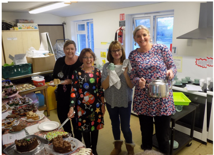
A few of our lovely parent helpers